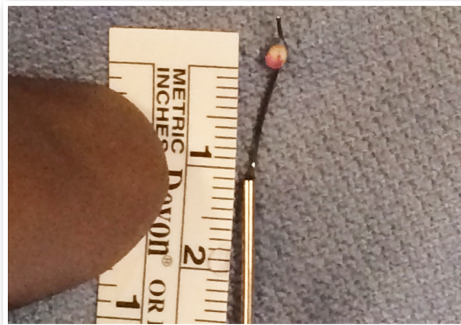
► Figure 2: A 3mm salivary stone retrieved via sialendoscopy and basket extraction.